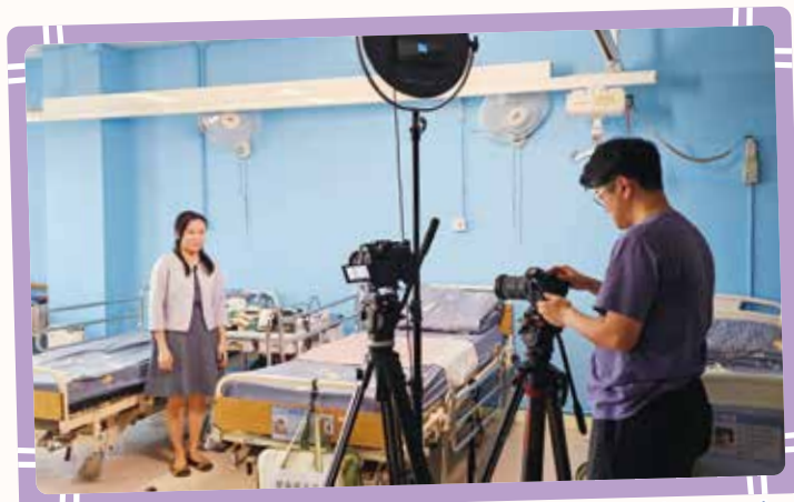
校長拍攝短片，介紹宿舍服務。The Principal presents dormitory services through a short video.

We are deeply thankful for the generous contributions already received from devoted supporters and parents. Their united love and commitment have allowed us to experience the warmth of the "Sunnyside Family." We sincerely invite you to continue walking with us, so that our children may live comfortably and learn joyfully in the embrace of Sunnyside.