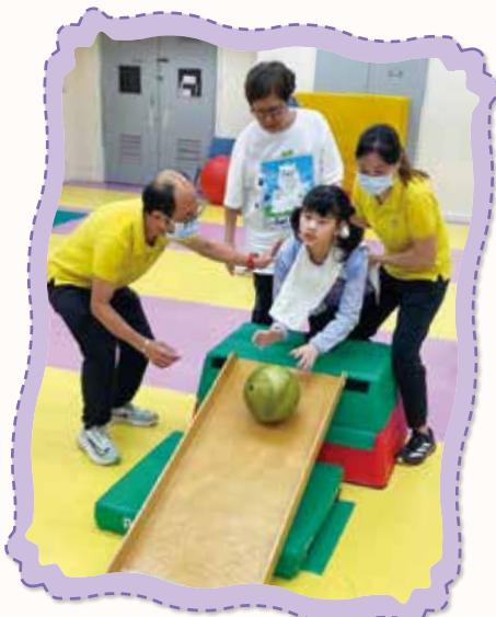
度身設計的宿生活動，動靜皆宜。Tailor-made hostel activities, suitable for both lively and quiet moments.