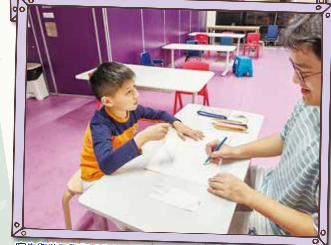
宿生與義工配對成為朋友仔，一對一玩遊戲、聽歌、畫畫。 Boarders and volunteers paired as friends to play games, listen to music, and draw one-on-one.