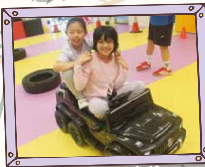
乘坐電動車 Riding an electric car