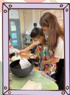
製作手漆扇 Making my own hand-painted fan