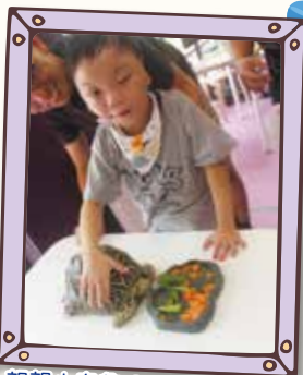
親親小烏龜 Sweet little turtle