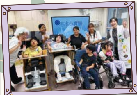
參與溶冰小實驗 Joining a melting ice experiment