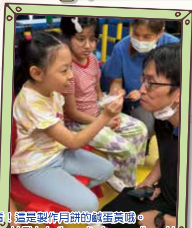
看！這是製作月餅的鹹蛋黃哦。 Look! This is the salted egg yolk making mooncakes.