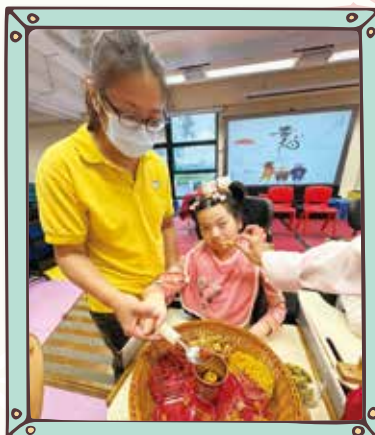
下午體驗花茶製作 Afternoon Flower Tea Workshop