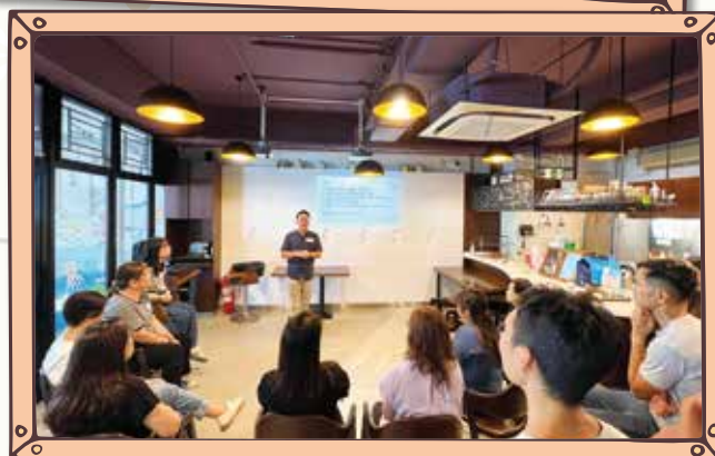
家長教師會幹事與新生家長及畢業生家長茶聚，交流聯誼。 Parent-Teacher Association (PTA) tea gathering with parents of new students and graduates for fellowship and sharing.