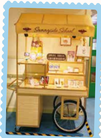
流動小賣車義賣學生作品 Charity sale of student works via mobile cart