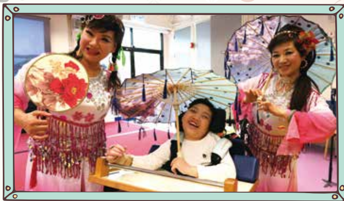
上午欣賞中國舞表演 Morning Chinese Dance Performance