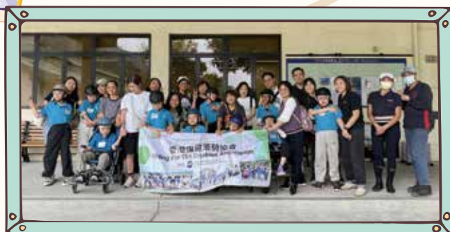
參觀屯門公眾騎術學校 Visiting Tuen Mun Public Riding School