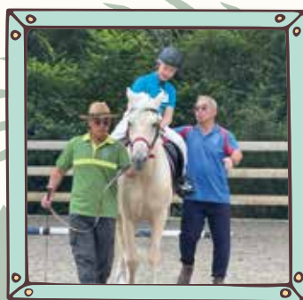
體驗策騎小馬 Experiencing pony riding