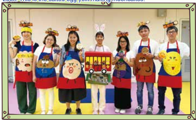
中秋節繪本劇場 Mid-Autumn Festival Picture Book Theatre