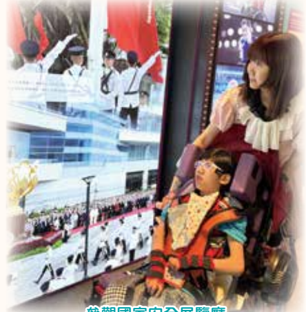
参観幽豕女王展算廳 visiting the National Security Exhibition Gallery

在學階一,學生透過電子書閱讀了解公園、圖書館和學 校的規則,並在使用學校圖書館及公園等設施時實踐出來, 學習愛護校園的重要性。老師拍攝學生在使用學校設施時的 守規行為,並製作相架張貼於班房的壁報上。