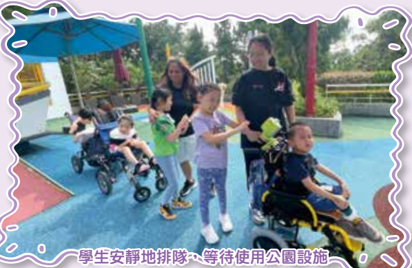
Students are lining up quietly, waiting to use the park facilities.

Our school held the "National Security Education cum Law Abiding Value Awareness Month" from September to October last year. The theme was "Obey the Law, Follow the Rules, Show Courtesy, and Be a Good Student." The activities covered all grades from Key Stage (KS) one to four, using diverse learning methods to establish good habits of following rules and showing courtesy, while recognizing the importance of obeying the law and learning knowledge related to national security.