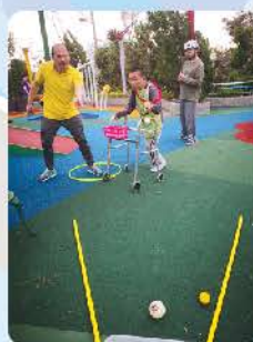
體能組：軟地拋球運動 PE group: ball game at playground

Immanuel House of boarders enjoys diversified activities like free time at Sensory Integration Room, housework group, physical education (PE) group and art group. They also hold regular boarders' meeting while the recent discussion was on selecting birthday cake at January's party.