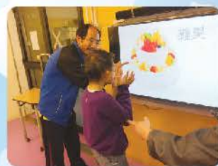
投票選舉喜愛生日蛋糕 voting on favorite birthday cake