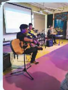
西區福音堂義工帶領敬拜活動 Volunteers of WDEC came to worship with students.

Starting from November 2018, volunteer from Western District Evangelical Church (WDEC) visits students of Haven of Hope Sunnyside Enabling Centre every morning. She sings hymns and prays with students and arranges weekly evangelistic gatherings to nurture their spiritual growth. The Centre also holds monthly religious activity for students to receive God's grace.