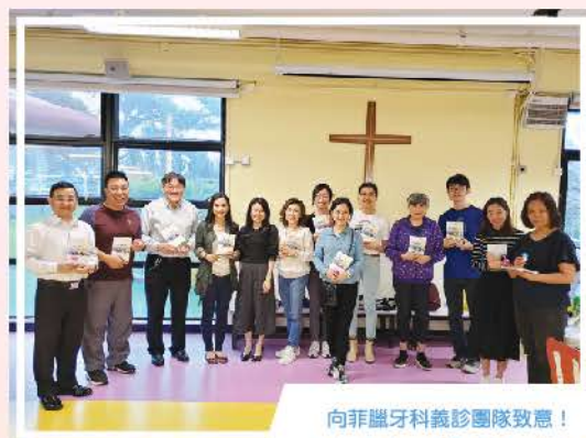
向菲臘牙科義診團隊致意！ salute to Prince Philip Dental Volunteer Team!