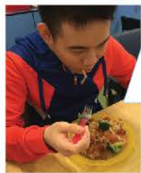
學生享受美食 Student savours good food.