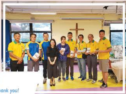
謝謝消防員義工！ fireman volunteers, thank you!