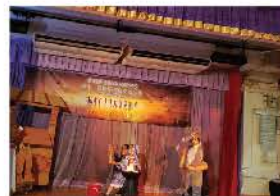
同學努力演出，表現投入。 Students engaged in their roles.