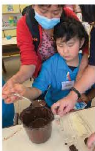
學生將巧克力醬舀入自己創作 的模具中，製作巧克力。 Student put chocolate syrup in her mould to make chocolate.