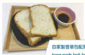
自家製香草包配黑醋 home-made herb bread with balsamic vinegar

This year, Health & Wellness Committee promoted lots of healthy meals for students to enjoy in the school, including home-made herb bread, baked chicken spaghetti with home-grown herbs, turnip cake in healthy style, rice with turmeric etc.. The committee also recommended parents to use "Snack Check" mobile application to choose healthy snacks, and would like to thank parents for their support and response!