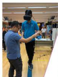
學生體驗自己身處萬丈高樓的 虛擬實境中，小心翼翼向前行。 Student experienced walking cautiously at skyscraper through virtual reality technology.

On 9 May, the SAME project held the 1st Joint School Technology Exhibition at Buddhist To Chi Fat She Yeung Yat Lam Memorial School. Participated by schools serving students of mild, moderate and severe intellectual disabilities, the exhibition was also visited by students of Lutheran School for the Deaf. The carnival let intellectually disabled students experience how technology applied in daily life through various activities.