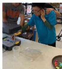
學生運用「真空吸塑」機 創作不同形狀的模具。 Student made different moulds using vacuum forming machine.