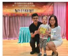
方舟別傳獲得最佳編導獎(金獎) Prelude to Noah's Ark won The Best Director (Gold Award).

The 12th Joint School Performing Arts Exchange was held successfully on 16 May, during which our students presented the drama, Prelude to Noah's Ark. The drama was so well received that we won The Best Director (Gold), The Most Creative Presentation (Silver) and The Best Actor awards. Credit goes to students who performed wholeheartedly and fearlessly. Gratitude also goes to parents and staff members for their assistance.