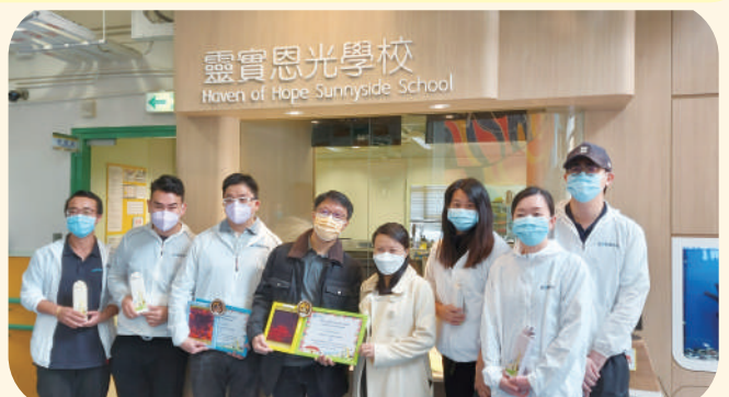
Germagic 團隊 Germagic Team