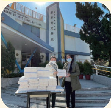
捐贈 iPad iPad donation

As it is written: "He has scattered abroad his gifts to the poor, his righteousness endures forever." (9:9 2 Corinthians, the Bible)