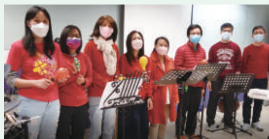
恩光使團獻唱聖誕詩歌 Sunnyside Mission team singing X'mas hymns

網上聖誕聯歡會以愛與眾學生和家長在線上聯繫，並慶祝主耶穌的生日。聯合醫院兒科醫護團隊的問候、恩光使團為我們帶來聖誕的真正意義、眾家長和學生的互相祝福、全校各部門愛的行動，如言語治療部與大家齊唱不一樣的聖誕歌、物理治療部鼓勵大家多做運動、職業治療部以訓練用具述說奉獻予耶穌的生日禮物、教務部的老師和助教載歌載舞、宿舍部以自家的服務來祝願大家聖誕快樂！從回應表及當日即時通訊的互動，可見學生、家長與同工們都十分享受呢。