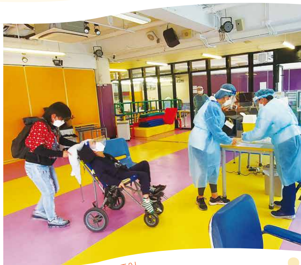
在熟悉的學校禮堂打針 Vaccination at the familiar school hall

The 5th wave of the epidemic has not yet been subsided; everyone has not slacked off but actively cooperated with the government's epidemic prevention measures. Sunnyside School hopes to protect the health of students by encouraging parents and assisting students to get vaccinated. It is hoped that Hong Kong will get out of the haze of the epidemic the soonest, and students can return to campus and continue to learn happily.