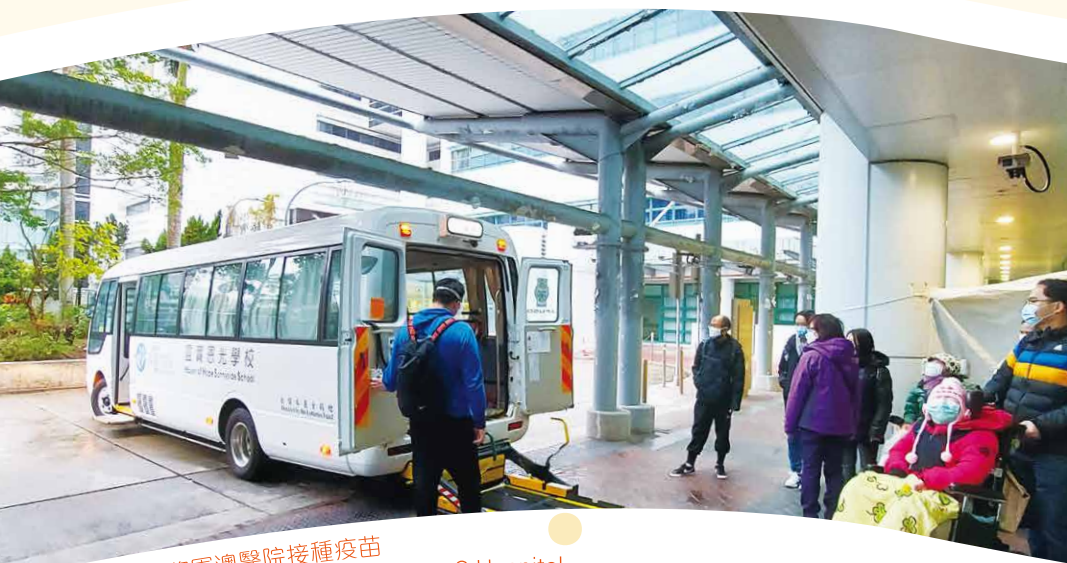
在將軍澳醫院接種疫苗 Vaccination at Tseung Kwan O Hospital

第五波疫情仍未遏止，大家未能鬆懈，更積極配合政府防疫措施。恩光學校亦希望藉著鼓勵家長和協助學生接種疫苗，守護學生的健康。期望香港早日走出疫情的陰霾，同學可以回到校園，繼續開心學習成長。