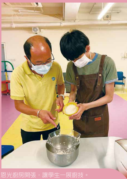
恩光廚房開張，讓學生一展廚技。 The opening of Sunnyside kitchen allows student to show off his cooking skills.