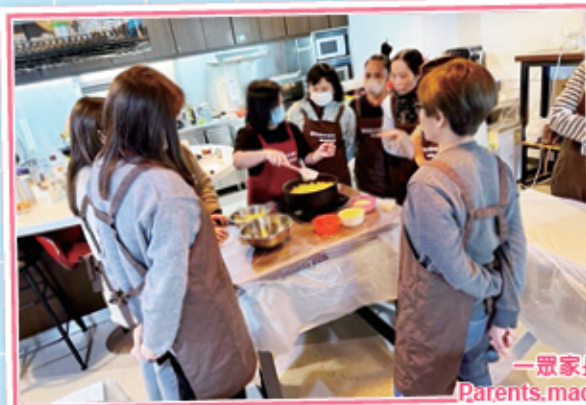
一眾家長精心炮製鳳梨酥 Parents made pineapple pastries.