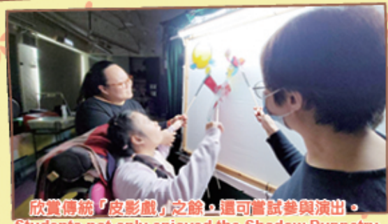
欣賞傳統「皮影戲」之餘，還可嘗試參與演出。 Students not only enjoyed the Shadow Puppetry Show, but also joined the performance.