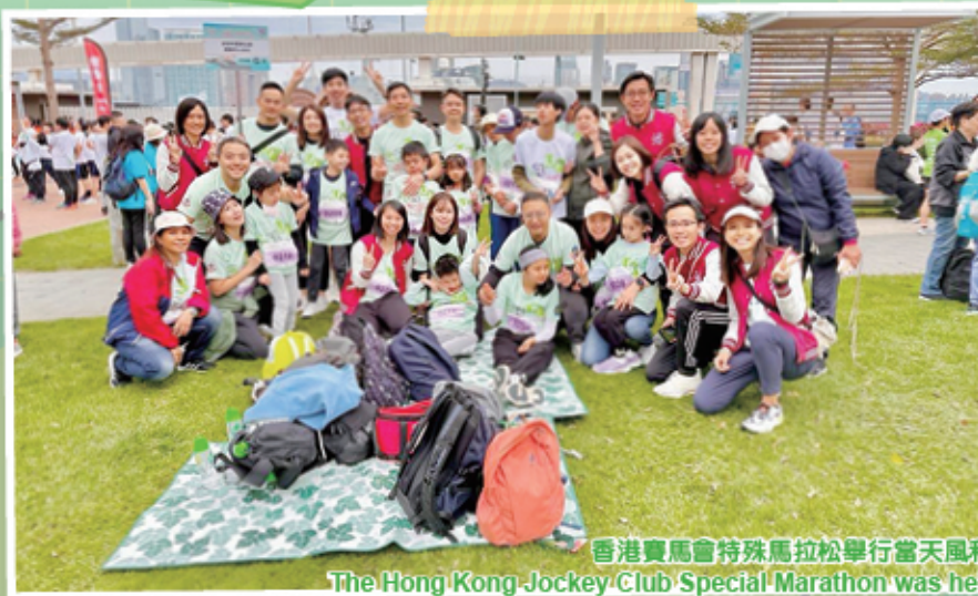
香港賽馬會特殊馬拉松舉行當天風和日麗 The Hong Kong Jockey Club Special Marathon was held on a beautiful sunny day.