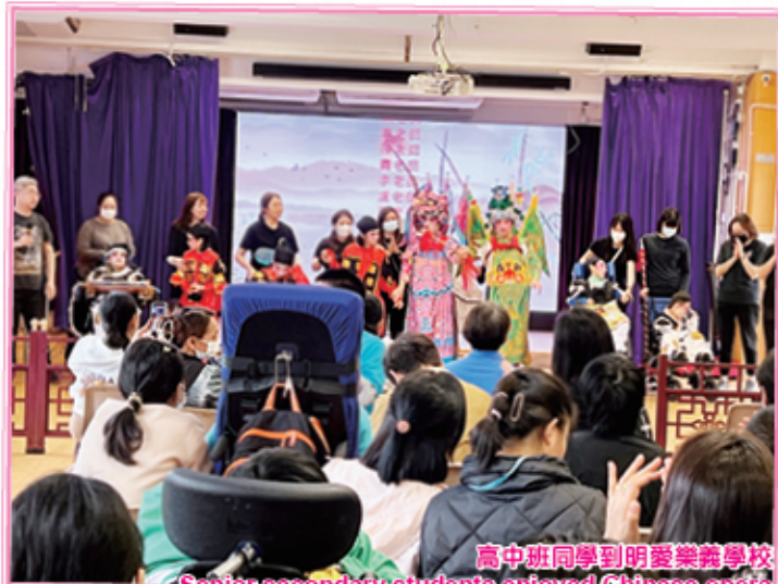
高中班同學到明愛樂善堂學校，欣賞該校學生演出粵劇表演。 Senior secondary students enjoyed Chinese opera show performed by students at Caritas Lok-Yi School.