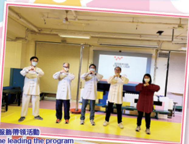
教職員穿上傳統服飾帶領活動 Staff in traditional costume leading the program