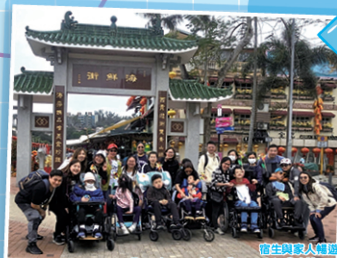
宿生與家人暢遊西貢海濱長廊 Boarders and family went to Sai Kung Waterfront Promenade for a day trip.