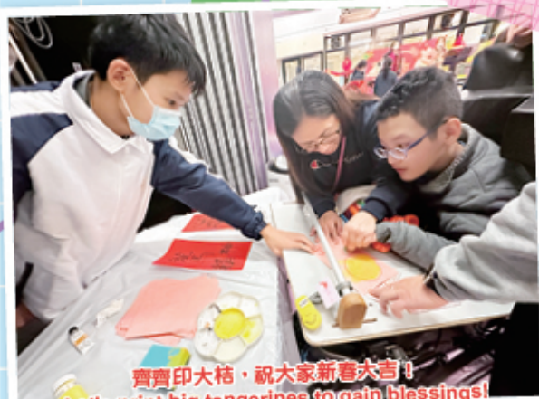
齊齊印大桔，祝大家新春大吉！ Let's print big tangerines to gain blessings!