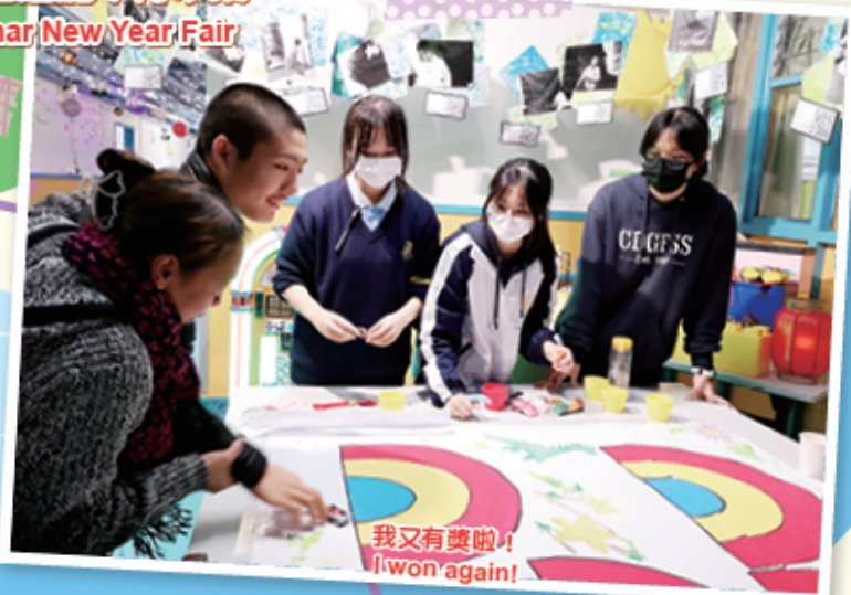
我又有獎啦！ I won again!