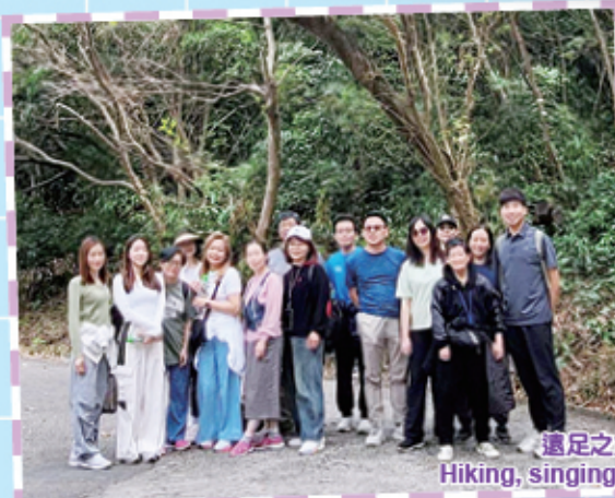
遠足之餘，更在山上唱詩敬拜神。 Hiking, singing and worshipping at Duckling Hill.