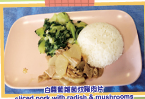
白蘿蔔雜菌炆豬肉片 sliced pork with radish & mushrooms

膳食組每月重點為學生介紹一種顏色的菜式，寓教導於食物中。例如三月份介紹白色的菜式，白色對應臟腑為肺，有利於養肺益氣，改善呼吸功能。同學享用了蟹柳豆腐蒸滑蛋、鮮淮山蒸肉餅和白蘿蔔雜菌炆豬肉片等，既美味，又健康！