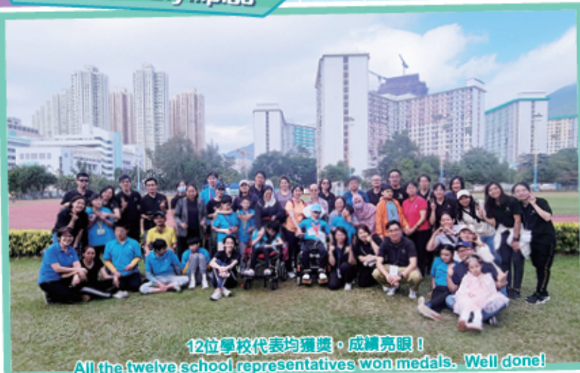
12位學校代表均獲獎，成績亮眼！ All the twelve school representatives won medals. Well done!