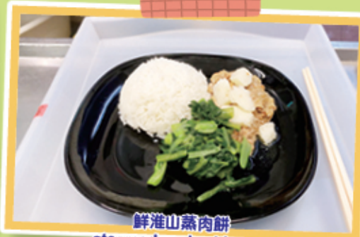
鮮淮山蒸肉餅 steamed pork with yam